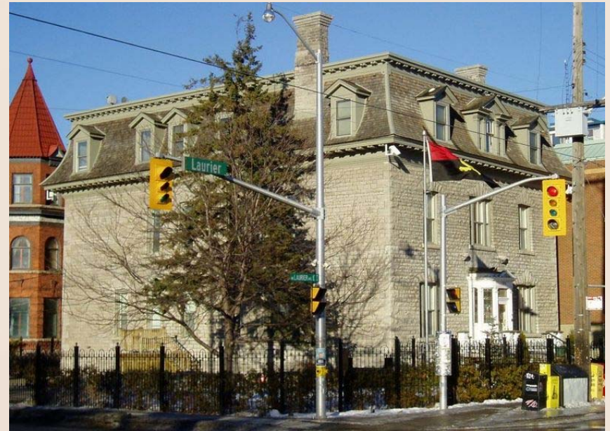
Information from Heritage Canada Foundation

The former Panet House, located in a historic neighbourhood, was built by Colonel Charles-Eugène Panet, Deputy Minister of Militia and Defence, in 1876.